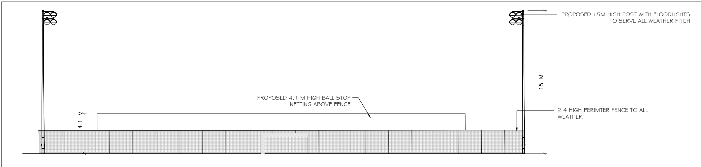
SOUTH ELEVATION SCALE 1:200